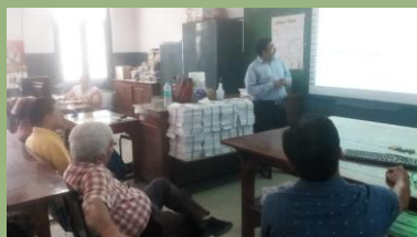
Department of Physics: Faculty members attending the expert lecture