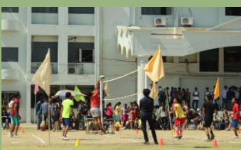
Sports: Volley players in action