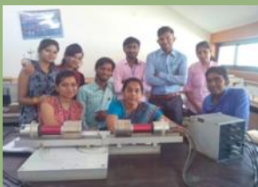
Lab workshop in I.P.S Academy