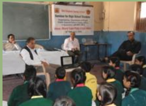
Seminar at Bharat Sagar Public School