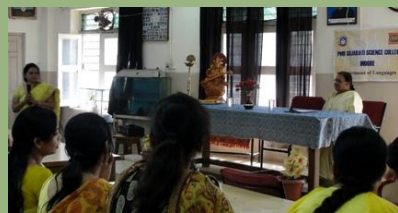
Basant Panchmi Celebration