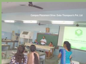
Campus Placement Drive : Duke Thompsons Pvt Ltd.