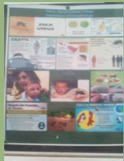
Zika Virus Poster