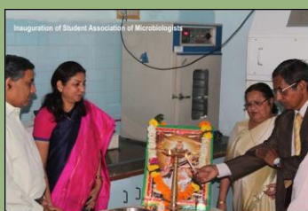
Inauguration of Student Association of Microbiologists