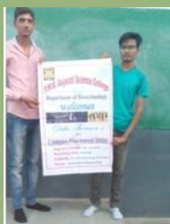
Campus Placement Drive by Duke Thompsons Pvt Ltd.