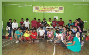
Sports: Players with dignitaries in annual sports