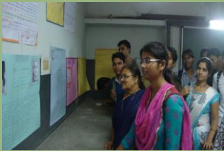
Maths poster exhibition