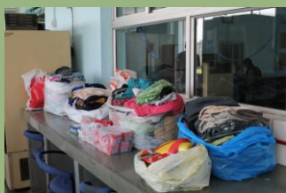
Joy of giving week