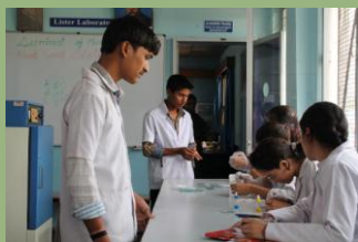
Blood Group Camp