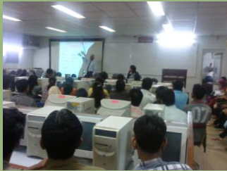
Personality Development Seminar at Computer dept..